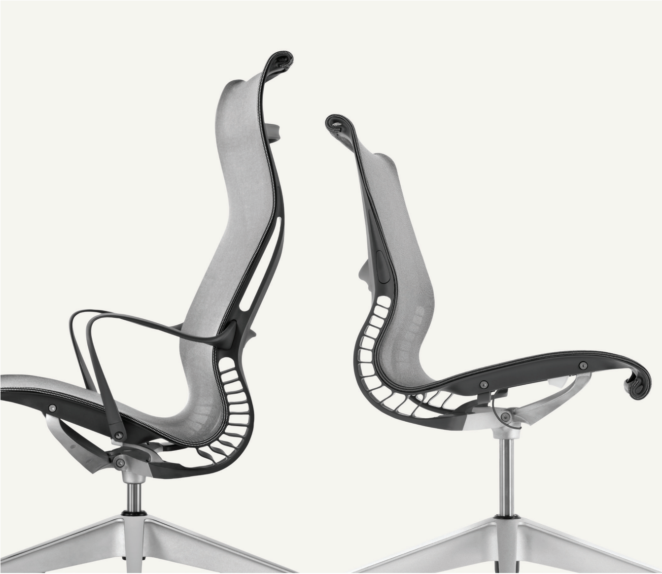
The versatility of the Kinematic Spine extends the Setu concept to support a variety of postures. With the Setu Lounge Chair, you can choose your ideal reclining position without making a single adjustment.