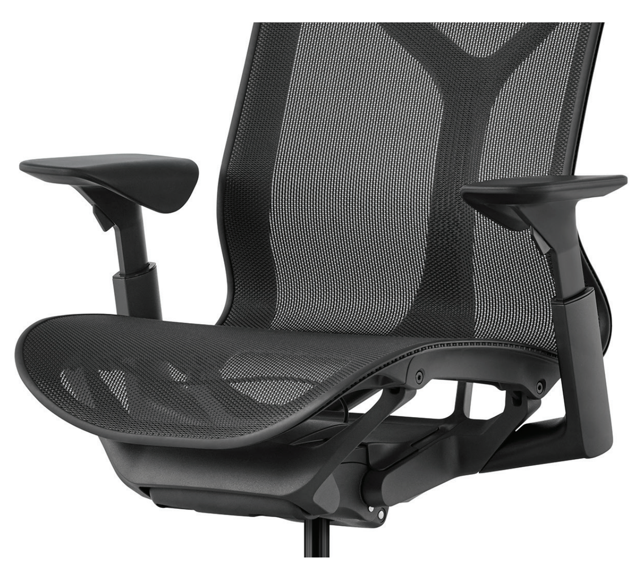
"You should have a chair that allows you to change postures as easily as possible," the designers say. "You can only do that with a chair that is correctly adjusted, so we wanted to build a chair that does that part for you."