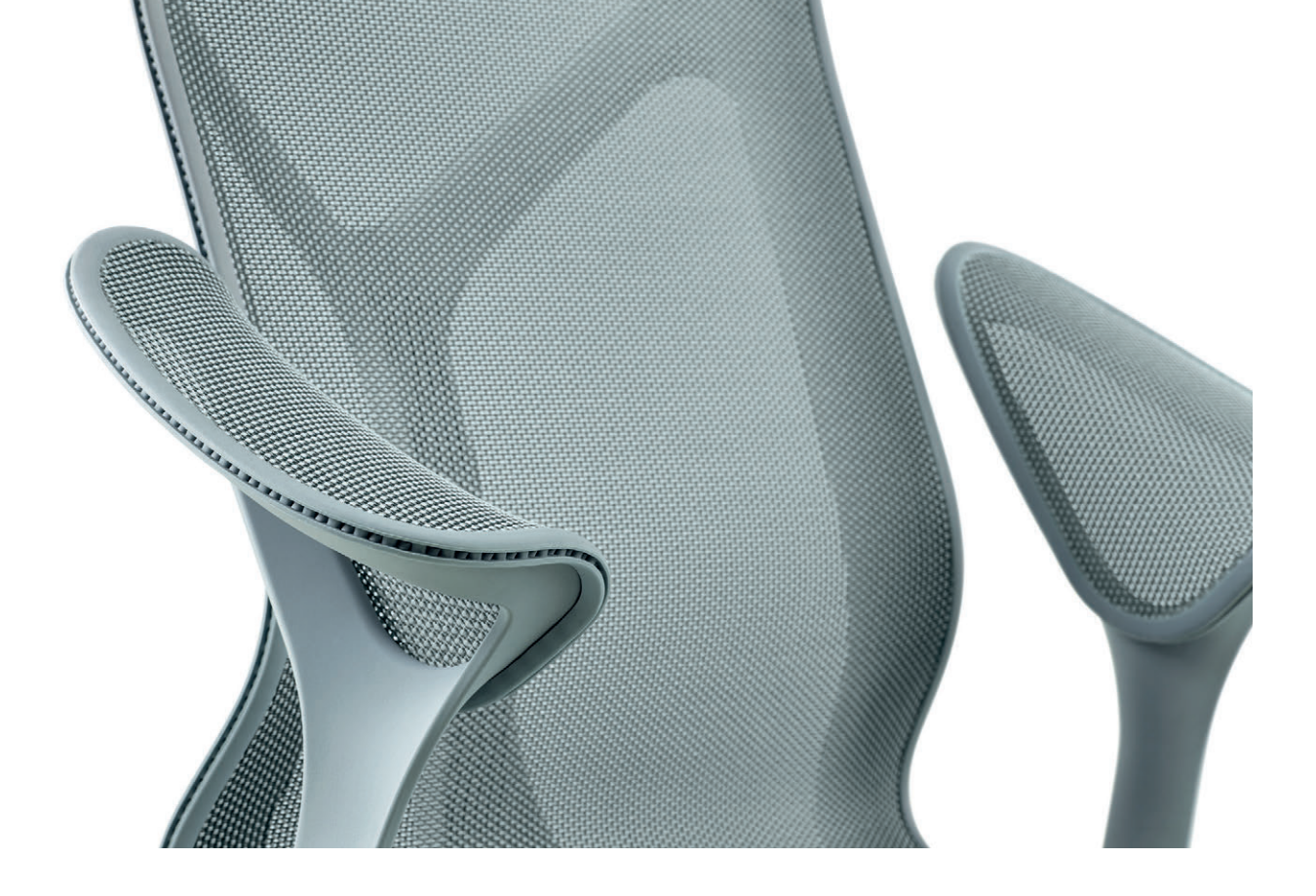
Cosm's innovative new Leaf Arms – the first of their kind – feature a soft but firm cradle design that provides a large, cozy resting place for your elbows. The arm rests make holding a phone or book natural and comfortable, and the angle of the arms mean they don't get in the way of a work surface when it's time to get back online.