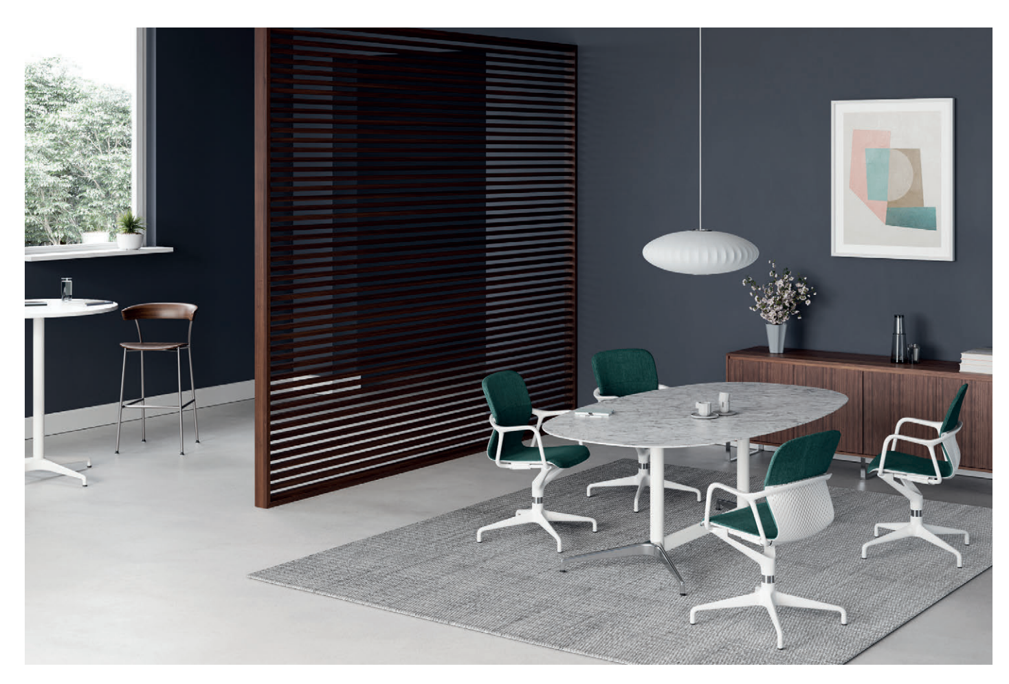
Marble surface with a slim profile edge for a premium finish.

While visual harmony is at the heart of Civic, this is coupled with a desire to celebrate the diversity of each client and celebrate the diversity of styles across many spaces. Civic pushes the boundaries of finishes through the introduction of lino, marble and soft-touch surfaces. These premium finishes paired with a slim profile edge can elevate a simple table to one which enhances where people work and meet.