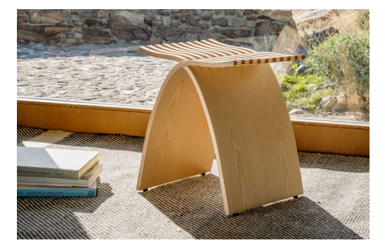
View image library